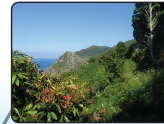
Cliff edge path round the headland

The Crosses — see below for how to get to them from the House